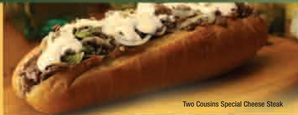
Two Cousins Special Cheese Steak

Must present coupon when ordering. Cannot be combined with any other offer or special. Expires: May 31 st , 2011